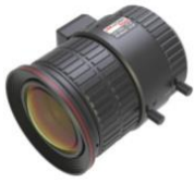
HV3816D-8MPIR 3.8 to 16 mm DC Iris