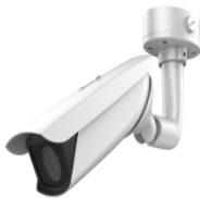
DS-1340HZ Outdoor Housing