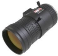
HV1140D-8MPIR 11 to 40 mm DC Iris