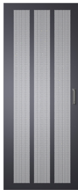
Single Perforated Door