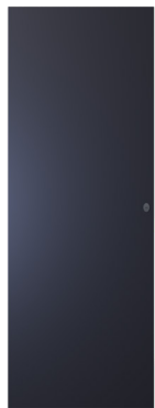
Single Solid Metal Door