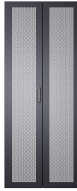
Double Perforated Door