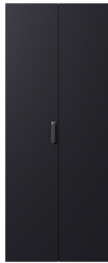
Double Solid Metal Door