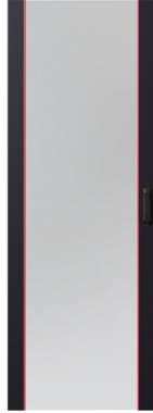
Single Glass Door