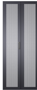
Double Perforated Door